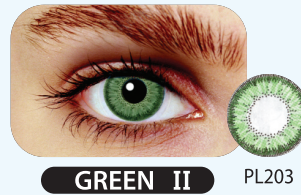
GREEN II PL203