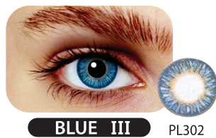
BLUE III PL302