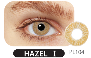
HAZEL I PL104