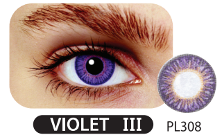
VIOLET III PL308