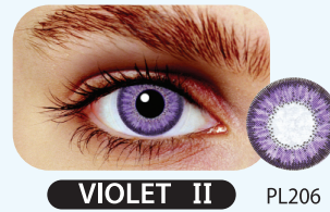
VIOLET II PL206