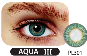
AQUA III PL301