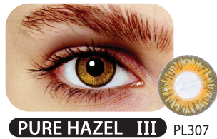
PURE HAZEL III PL307