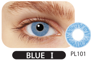
BLUE I PL101