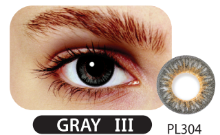
GRAY III PL304