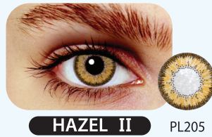
HAZEL II PL205