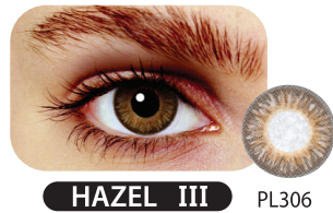
HAZEL III PL306