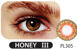
HONEY III PL305