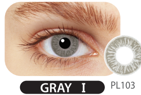
GRAY I PL103