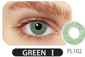
GREEN I PL102