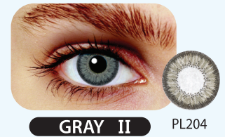
GRAY II PL204