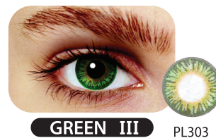
GREEN III PL303